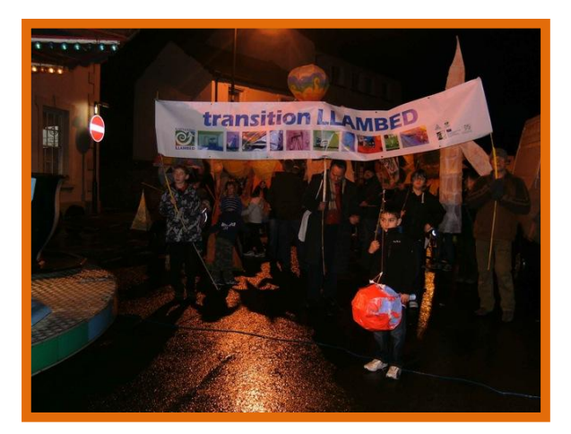
Transition Llambed's lantern procession.

The first carnival took place in 1964, encouraging people, both black and white, to go onto the streets and express themselves socially as well as artistically. Today it is well-known the world over and attracts many hundreds of thousands of people each year.