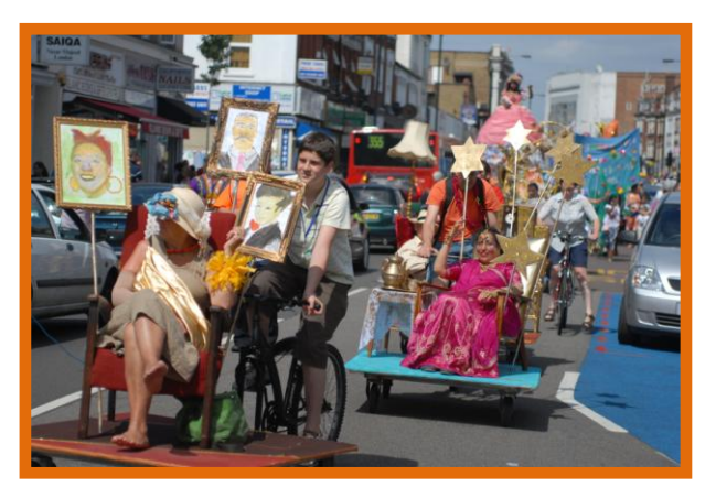
Young people pedal their elders through the streets of Tooting as part of the Trashcatchers' Carnival, summer 2010.

Many celebrations have been born out of freedom and diversity, particularly in times of great injustice and inequality. For example, the UK Notting Hill Carnival began in Trinidad when the first carnival was held in 1833 to mark an end to slavery in the