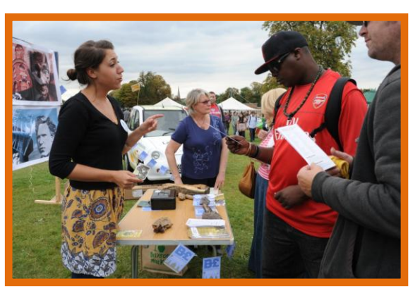
Promoting the Brixton Pound at the Urban Green Fair in Brockwell Park, London.

Although our wants and desires may vary, we all ultimately hold the same basic needs in common. According to the Development Specialist, Max-Neef, there are nine basic,