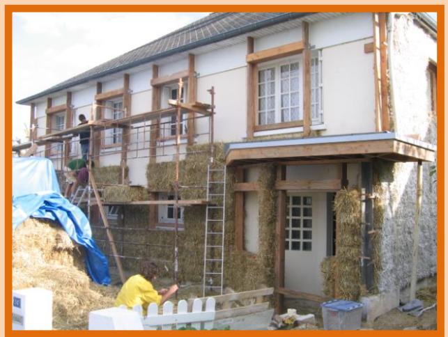
This house in France is being retrofitted using strawbales. Using the same approach here could lead to new local businesses, skills and retraining.

People who own their own homes in town XXX make up 52% of the population. As these people tend to have more freedom and money available to make adjustments to their homes that reduce their energy use and carbon footprint, the group decides to target these people. After all, they are the "low lying fruit". A project is set up to support homeowners to take advantage of feed-in-tarrifs which enable people to be paid for extra energy they produce from the renewables they install. The fact that the money used to pay for this comes from higher energy bills paid for by the people who can't afford renewables, is ignored.