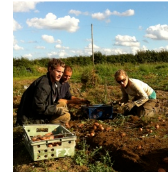
Following the tractor picking up potatoes

FarmShare is committed to working to the highest agro-ecological standards. We use no synthetic fertilizers, herbicides or pesticides but instead manage the farm according to organic principles.