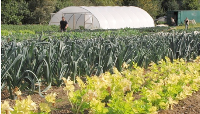
Late summer on the farm

Norwich FarmShare is a community working together to create a more resilient food supply for Norwich. We invite you to join us in growing and sharing the harvest while taking the greatest care of the land and its wildlife.