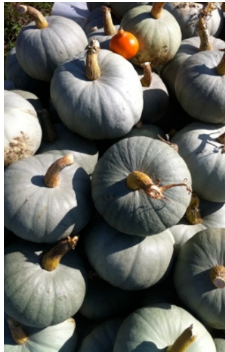
The squash harvest

Norwich FarmShare currently rents 5 acres of gently sloping loamy land in Postwick and on the edge of Norwich. Over the next couple of years we plan to increase our vegetable growing area by a further 2 acres.