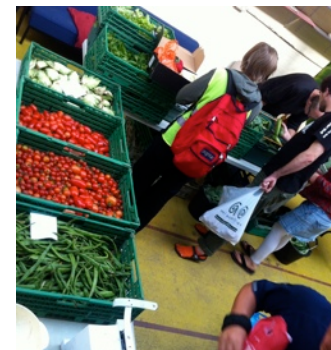
Sharing the harvest at the Food Hub

FarmShare's team of growers harvest every Thursday morning - in fact it's a great time to visit the farm if you want to volunteer. In the afternoon the vegetables are delivered to our Food Hub in Norwich: it's that fresh!